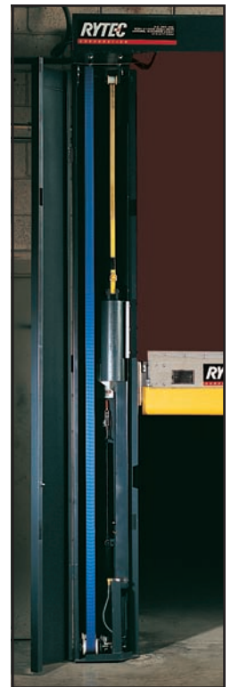
Patented System II independent counterbalance and tensioning system.