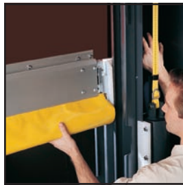
Easily resets, without the need for tools